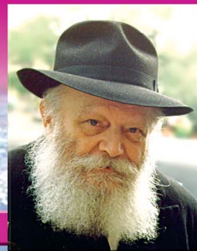
The Rebbe King Moshiach שליט"א

Torah portion: Ki Tavo, 15th of Elul 5762 (08/23/02)